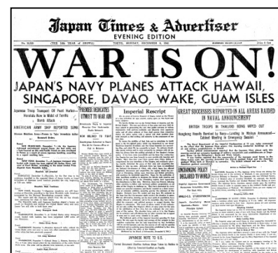
Outbreak of the Pacific War (Dec. 8, 1941)